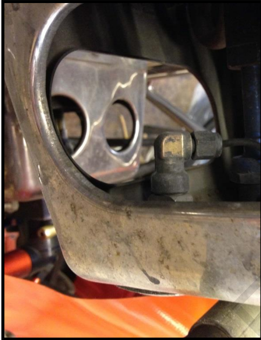
FIG1: Brass Fittings

Inspect each burner unit to determine whether the pressure gauge fittings are brass or stainless steel (see figure 1 and 2).