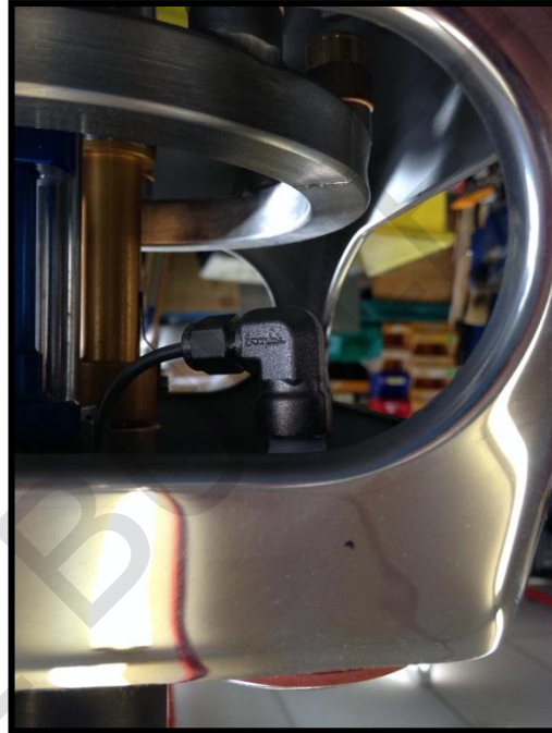
FIG 2: Stainless Steel Fittings

Note: It may be necessary to locally abrade the fitting to remove combustion products using Scotchbrite or similar.